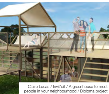
Claire Lucas / Invit'oit / A greenhouse to meet people in your neighbourhood / Diploma project