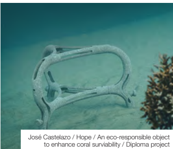
José Castelazo / Hope / An eco-responsible object to enhance coral survivability / Diploma project