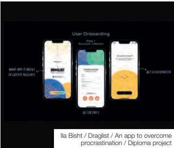
Ila Bisht / Draglist / An app to overcome procrastination / Diploma project